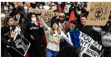
Demonstrators at the Black Lives Matter protest in Sydney on Tuesday

Observing with great concern the social unrest unfolding in the United States, Pope Francis said yesterday that no one can claim to defend the sanctity of every human life while turning a blind eye to racism and exclusion.